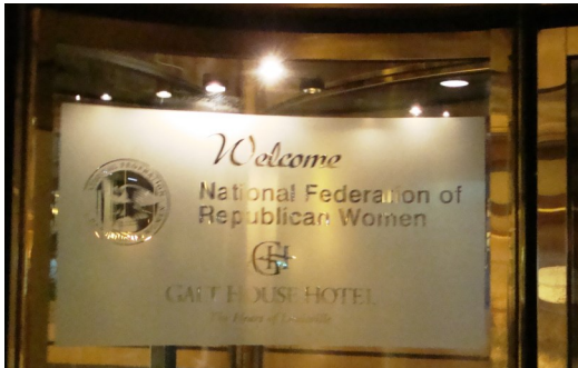
Our NFRW "Welcome" at the Galt House!

If you missed the NFRW's 37th Biennial Convention in Louisville, September 19-22, 2013 , you missed a great event! Enjoy some of the pictures ~ look for a slideshow at our meeting on the 28th!