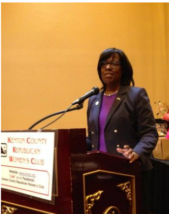
Jenean Hampton spoke at our meeting. She is our new Lt. Governor.

11/23 - KCRWC's Holiday Celebration with election of officers at the Oriental Wok. Doors open at 6:30pm